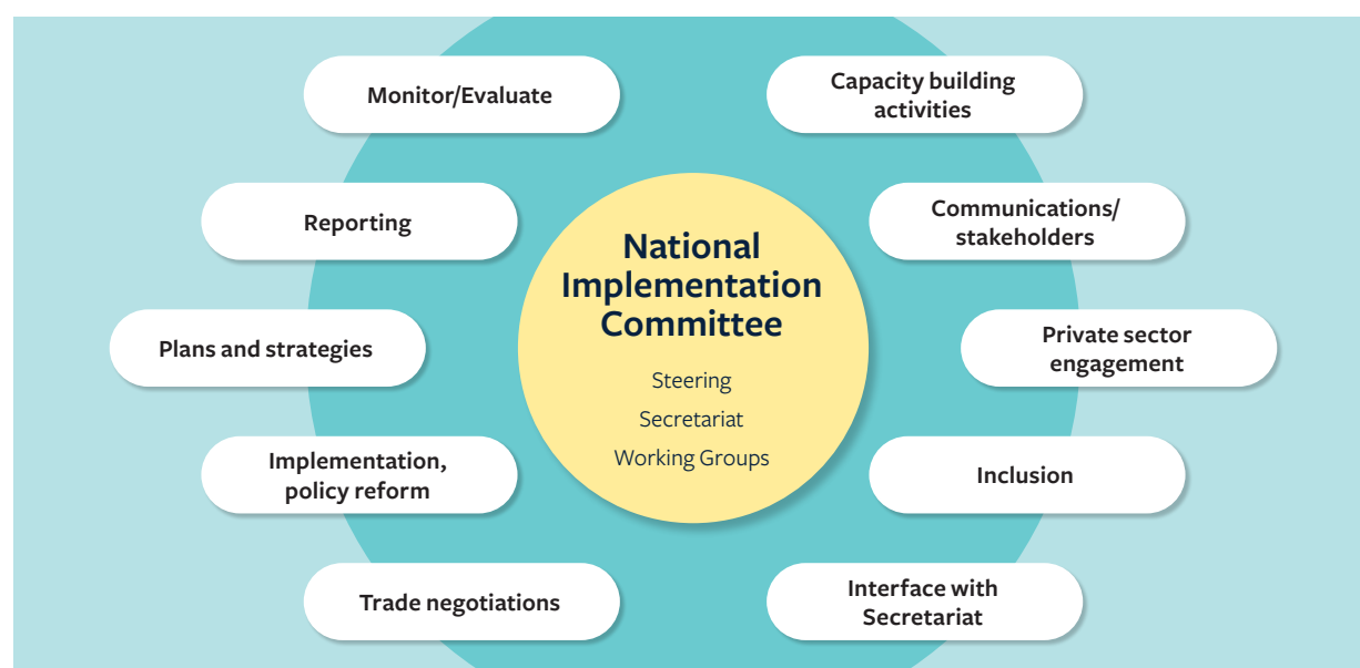
Figure 1 Ten essential functions of NICs