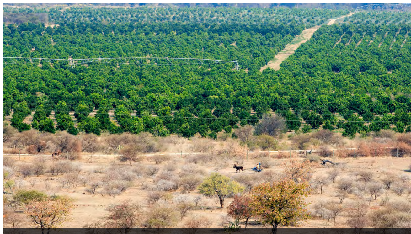
View of Shashe irrigation scheme and citrus orchard in a semi-desert area, Maramani Communal Land, Zimbabwe.

low reliability of electricity supplies pending installation of solar power. Future progress will depend on the Maramani community's ability to maintain the irrigation system, cover utility costs and manage funds to replace expensive technical equipment when necessary.